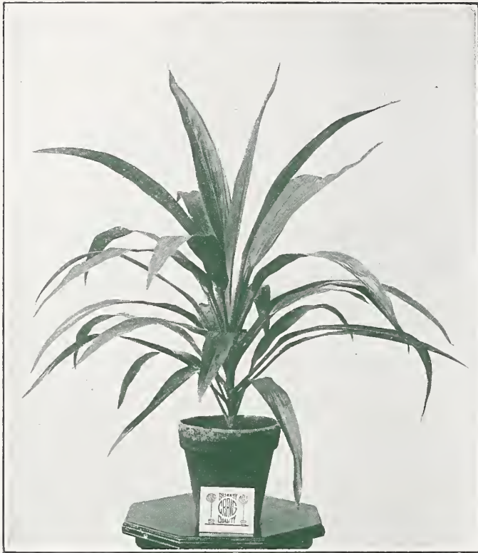
DRACAENA LORD WOLSELEY